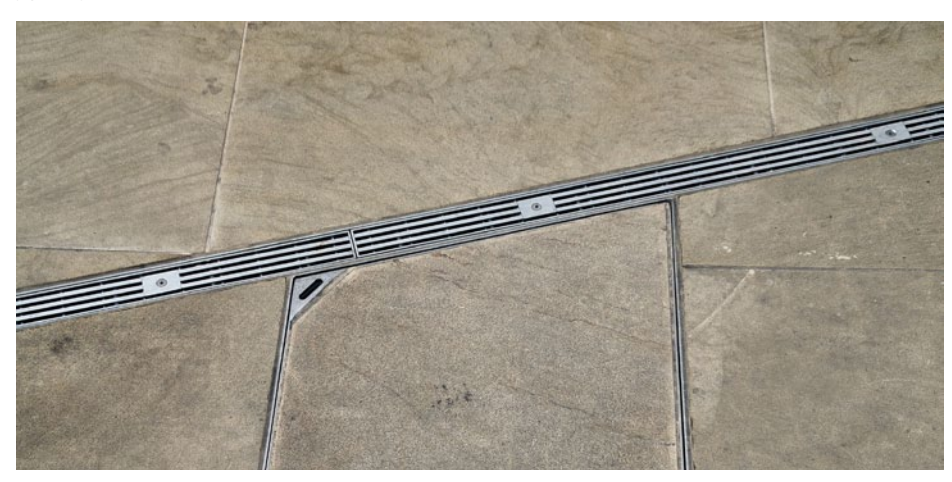
"The drainage solution provided by ACO has operated successfully and it has been appreciated thanks also to its aesthetic qualities, with a design which is well suited to the dynamic architecture of this outstanding building."